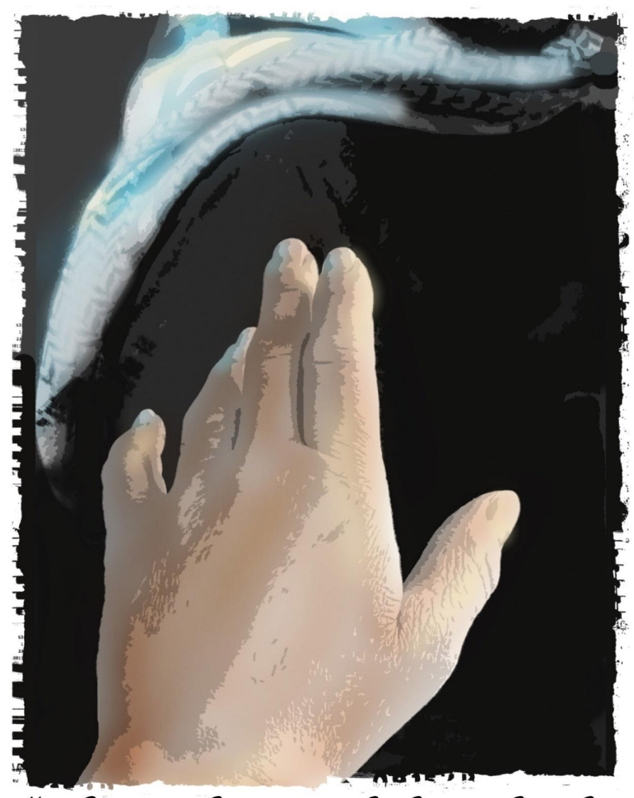
"If I only touch his cloak, I will be made well."